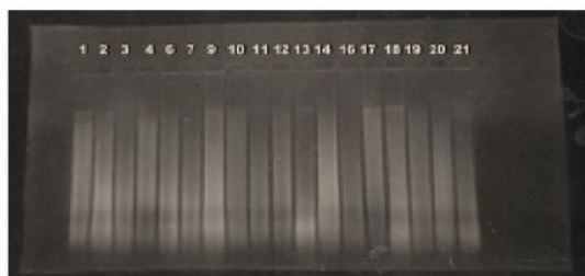
Figure 1. Result of DNA Band Visualization CTAB Method

Isolation of Rice DNA of local variety of South Sumatera using DNA method of Genomic DNA Purification System Kit from