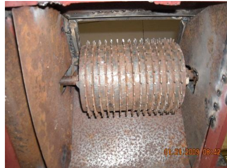
Appendix 2. Palmoil empty fruit bunch circular saw crusher using belt-pulley transmission