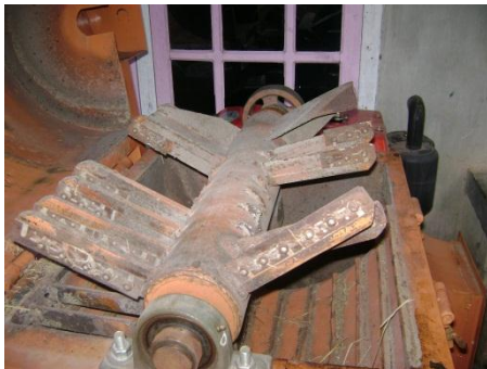
Appendix 1. Plant residue crusher knife type using belt-pulley transmission