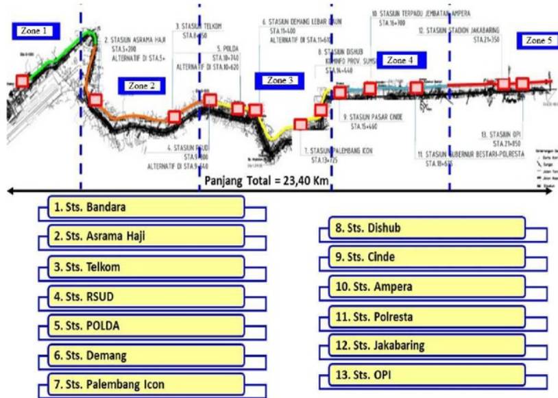
Figure 2. LRT Zone Employment Zone Map Location