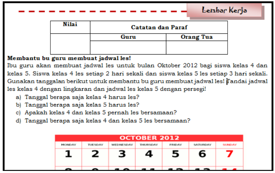
Figure 1. Samples of Portfolio Task for LCM

Upon completion of this activity, the teacher guided students to construct their own knowledge of the LCM. The teacher asked the students some questions, did two groups ever clapped together? At the time of group A and B clapping together that common multiple of 2 and 3. From here, students can understand the concept of LCM. Then the students were asked to describe the sense of the least common multiple. After this activity, students are doing worksheets. This worksheet will be part of a collection of portfolios. Teachers and parents are involved providing motivation or feedback to students in the notes column.