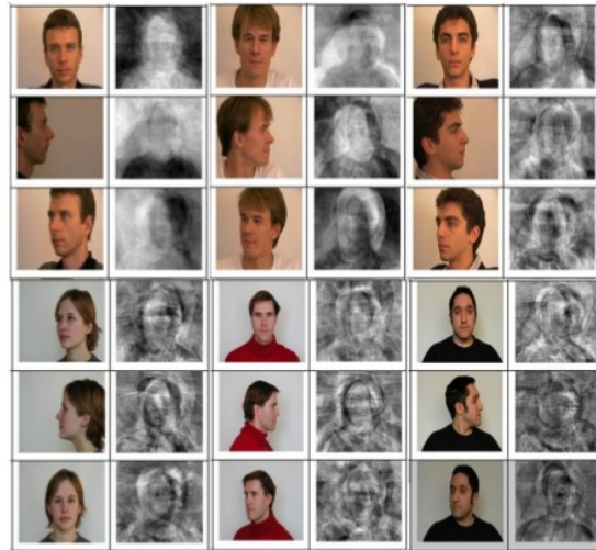
Figure 3. The result of eigenface method