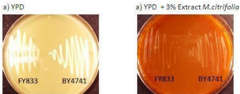
Figure 1. The phenotypic sensitive growth of S.cerevisiae in the presence of 3% noni fruit extract (a) and without extract (b). Phenotypic growth was observed after incubated at 30 °C for 24-48 hours