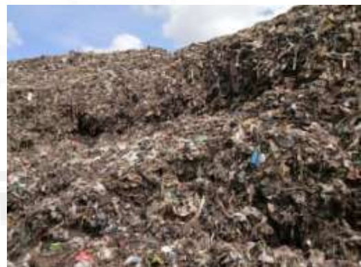
Figure 1: Waste landfill at Sukawinatan in Palembang, South Sumatra, Indonesia.[2]

Knowing the corrosion rate of metals at the site of waste landfill is supported to improve the management of waste disposal and to anticipate the impacts of water contamination to Low Carbon Steel (LCS) corrosion reaction.