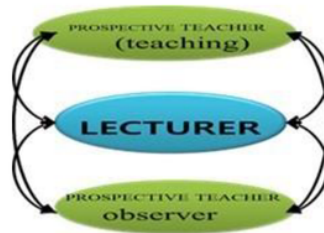
Figure 1. Peer Coaching Approach