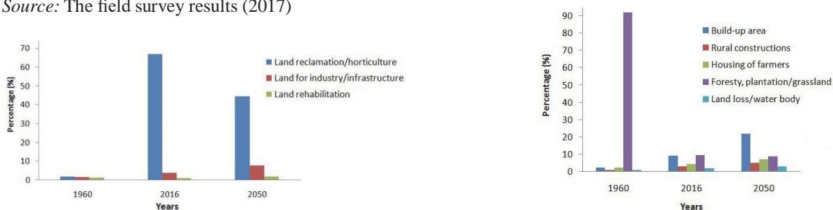
Fig. 2. Dynamics of landuse changes in Banyuasin wetlands