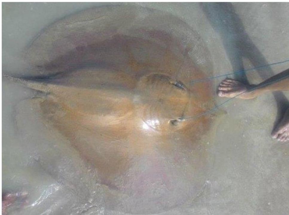
Figure 2. Another side of Urogymnus dalyensis caught on 24 December 2017 at Lampu Satu beach, Merauke district, Papua province, Indonesia.

Dr. Mabel Manjaji-Matsumoto, the leading expert for dasyatids of the Indo-Pacific region (Pers. Comm. via Muhammad Iqbal). U. polylepis is the only similar species to U. dalyensis (Last et al., 2016b). The main characters of the upper surface to distinguish U. dalyensis from U. polylepis are the proportion of the tail length (1.9–2.2 vs. 2.8–3.1), and the size of the mid-shoulder denticles (2–4 greatly enlarged denticles vs 1–6 small or inconspicuous). Unfortunately these characters are not clear in the photographs. However, U. dalyensis has a combination of yellowish brown dorsal surface, and length of orbit and spiracle 2.6–3.2 in snout length (Fig. 1-2); vs greyish or brownish dorsal surface, and length of orbit and spiracle 3.3–4.4 in snout length (Last et al. 2016b).