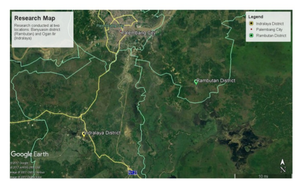
Figure 1. Research map: research conducted at two locations: Banyuasin district (Rambutan) and Ogan Ilir (Indralaya).