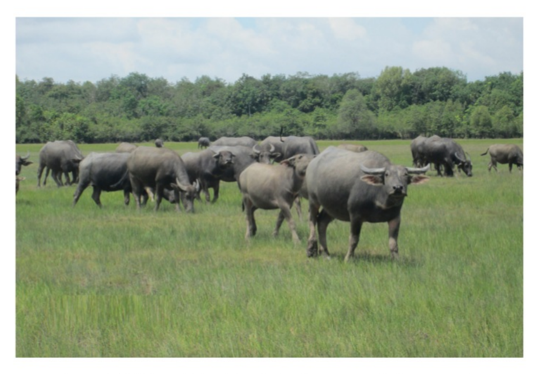
Figure 4. Buffalo condition in Rambutan district when looking for food.