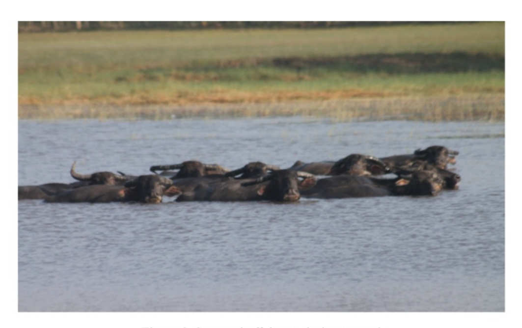
Figure 3. Swamp buffalo much time to soak.