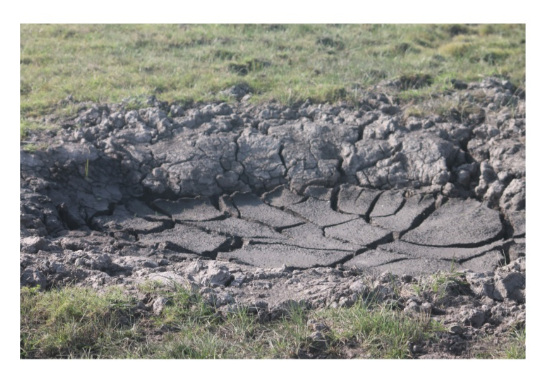
Figure 2. Puddles conditions during dry season.