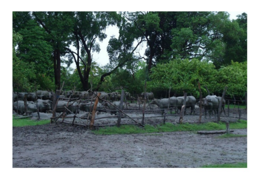
Figure 6. Cage buffalo in Indralaya district no roof cage.