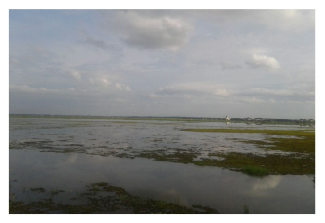
Figure 5. Condition of buffalo habitat in Indralaya district.