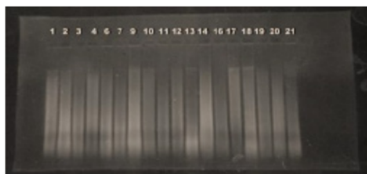
Figure 1. Result of DNA Band Visualization CTAB Method

Isolation of Rice DNA of local variety of South Sumatera using DNA method of Genomic DNA Purification System Kit from