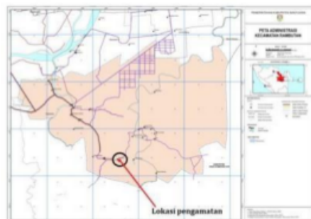
Fig. 1. Sampling location

Blood sampling place the swamp Buffalo ( Bubalus bubalis ) in the area of TanjungSenai, Ogan Ilir Distrik, South Sumatera. Separation of serum is performed in the integrated laboratory Postgraduate Sriwijaya University. The research of DNA isolation, quantification of DNA and PCR-RAPD performed in the laboratory of Biochemistry at the Faculty of biology of the Gajah Mada University.