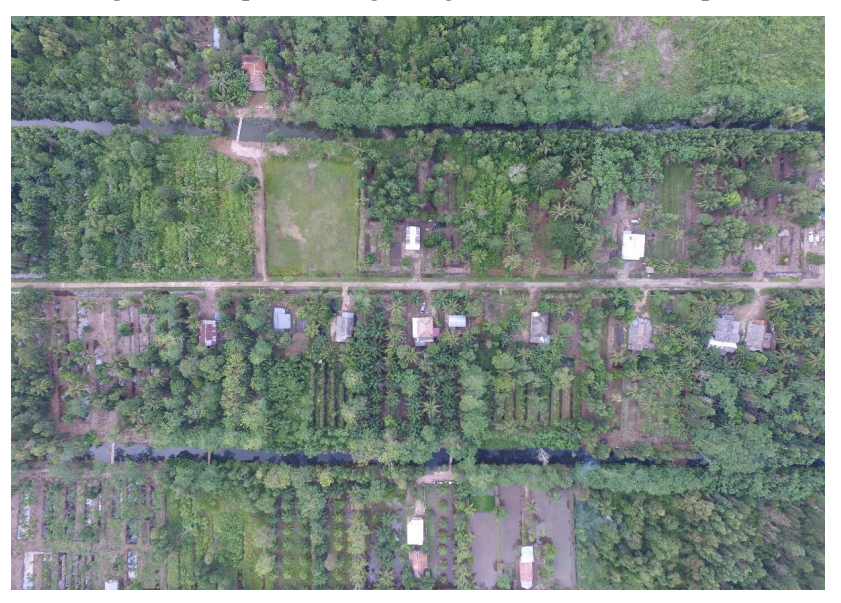
Figure 2. Map of Muara Sugih village, Tanjung Lago sub-district.