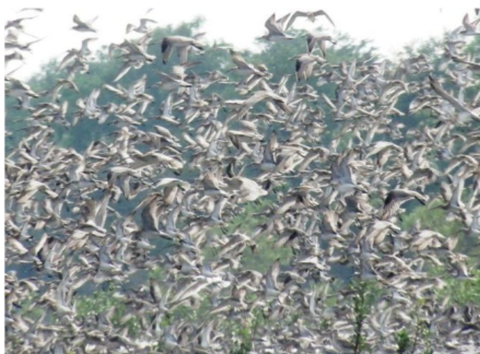
Fig 2. Mix flocks of Asian Dowitcher and Godwits on 13 November 2018 in Banyuasin peninsula, South Sumatra province, Indonesia

In North Sumatra, it was reported a total of Asian Dowitchers (6,970 birds at Sejara beach, and 987 birds at Tiram bay) on 28 March 2002; but it was only 160 birds reported at Asahan river on 25 September 2005 [28]. In addition, a survey during seven months (October 2014-April 2015) observation in Percut, North Sumatra, recorded total 321 birds. Based on this observation, number of Asian Dowitchers in North Sumatra look like a decline from 1987 to 6,970 birds in 2002, to 160 birds in 2005 and 321 birds in October 2014-April 2015. Another observation is from Asian Dowitcher east coast along Deli Serdang during 1995 to 2005 that the largest number reported 2,370 birds in 2002 [29]. Asian Dowitcher trend show similar declining pattern in Banyuasin peninsula, with the largest number recorded c. 6,970 birds in 2002, but the number in one single survey had never been recorded to 2,500 birds after 2002. However, due to the similar characters with the Godwits and usually mix of these taxa in flocks (Fig. 2 and 3), it is estimated that the number of Asian Dowitcher in Banyuasin peninsula could be still a maximum number of 5,000 birds.