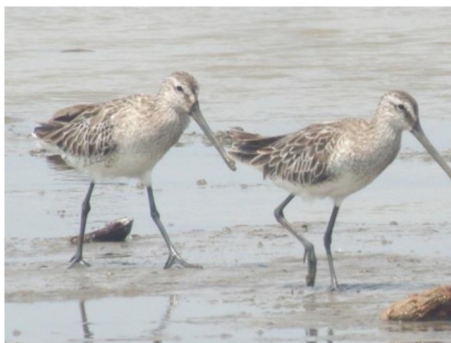
Fig. 3. Two Asian Dowitchers on 22 December 2019 in Banyuasin Peninsula, South Sumatra province, Indonesia