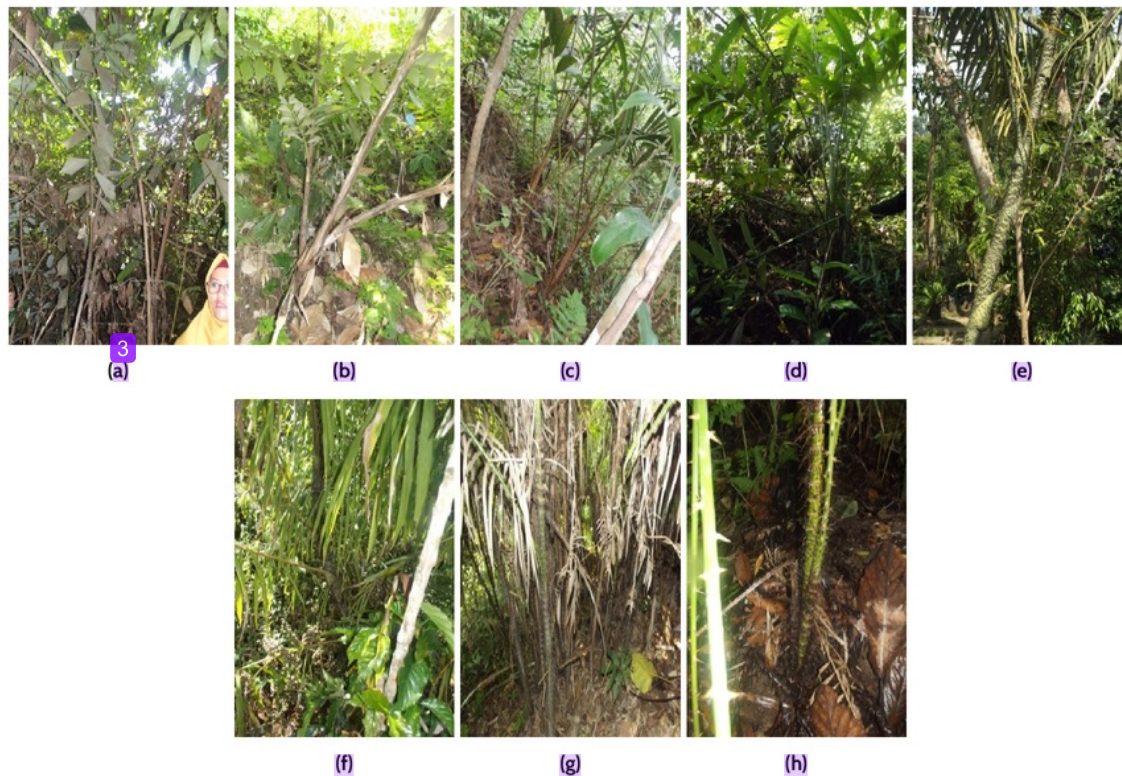
Figure 3. (a) Rattan Kayu in Bentayan Wildlife Reserve, (b) Rattan Kayu in Bukit Cogong Protected Forest, (c) Rattan Semambu in Bukit Cogong Protected Forest, (d) Rattan Semambu in Gunung Raya Wildlife Reserve, (e) Rattan Manau in Bukit Cogong Protected Forest, (f) Rattan Manau in Gunung Raya Wildlife Reserve, (g) Rattan Lelak in Bukit Cogong Protected Forest, (h) Rattan Lelak in Gunung Raya Wildlife Reserve.

surfaces of the leaves are brownish green and thorny.