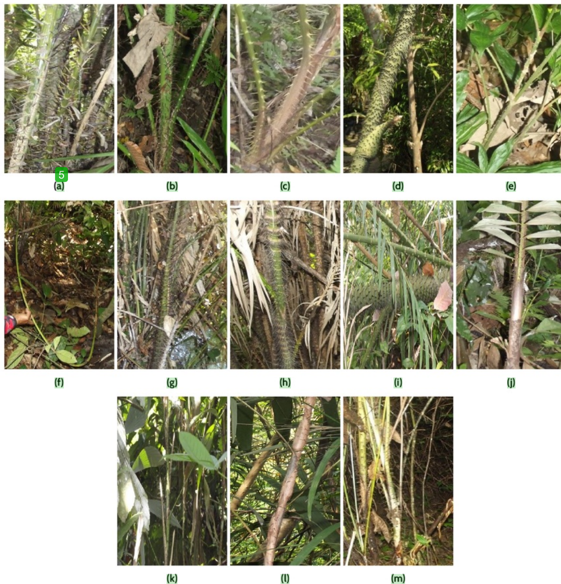
Figure 1. Morphological Differences of thorns on the stems of rattan species (a) Calamus pogonacanthus (b) Calamus orthostachys (c) Calamus scipionum (d) Calamus manan (e) Calamus javensis (f) Calamus ulur (g) Daemonorops robusta (h) Daemonorops sabut (i) Daemonorops margaritae (j) Korthalsia ferox (k) Korthalsia junghuhnii (l) Korthalsia echinometra (m) Plectocomiopsis geminiflora .