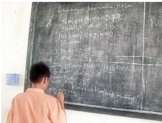
Gambar 3. A student represent his group to explain their answer of the problem in the student worksheet.