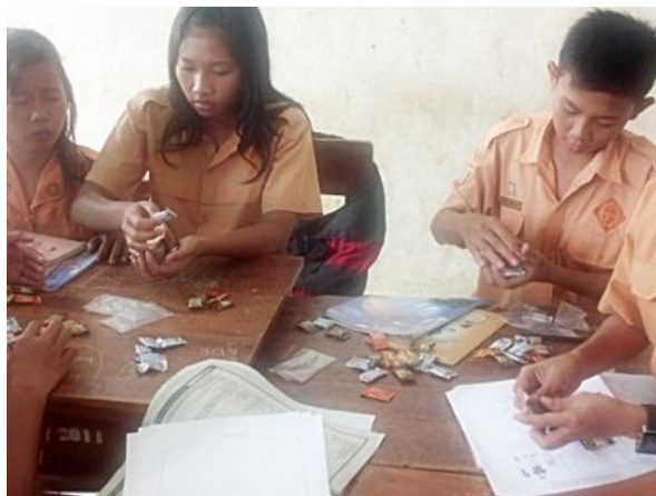
Figure 2. Student using the model of in problem that display in the students worksheet

After the product ready, the next step is field test. The learning set in third prototype was tested to the research's subject, that 26 students grade VII Junior High School 8 Lahat. During the learning process, student's activity was giving attention. In the last session of learning, student requested to doing the evaluation problem.