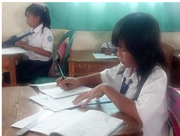
Gambar 4. Student doing evaluation problem

Figure 2 and 3 Show the students activity during the learning process, and picture 4 show student's activity when doing evaluation problem.