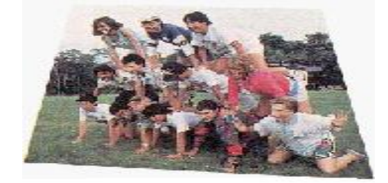
Figure 5. Human pyramids

Students are given the opportunity to learn in a group of 4 people. Then the teacher giving the issue of context (all groups get the same problems) which will be solved, namely as follows "have you ever find cheerleaders (cheerleader) doing the sports highlights in a game (such as basketball)? Often in force they form a pyramid of men, the one standing between pemain-pemainnya, so that at its height just stand alone. In the Figure below be considered that the human pyramid peak. Human pyramid is the highest ever made in 1981 in Spain. The height is 9 levels. How will they make a pyramid? Whether it's human pyramid-shaped pyramid? Please specify the exact form to explain it! How many people when the high level 2, and level 3?"