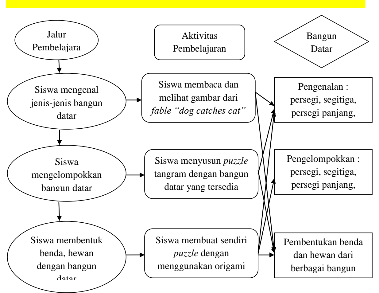
Figure 4.2 HLT Topic Introduction, Classification and Formation Build FlatB. Retrospective Analysis

1. The role of instructional design approach PMRI