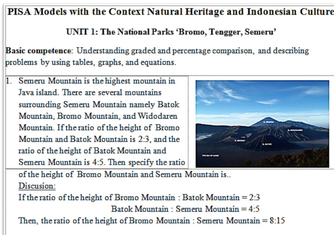
Figure 1: Task 1 before revision