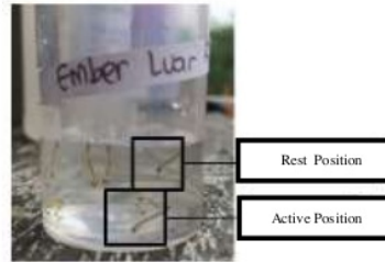
Figure 1. Active Position and Rest Position Mosquito Larvae

The observations under the microscope were performed to distinguish between these genera with weak magnification, as shown in Figure 2.