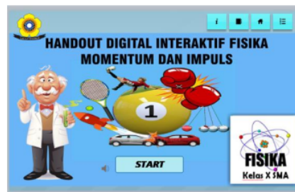
Figure 1. Interactive digital use of physics on momentum and impulses

Based on the data above, many students do not understand momentum and impulse material, so they need to use interactive digital handout tools to improve their understanding during the learning process, improving students' learning abilities. After the media was developed later, testing the interactive digital handout on the momentum of physics material and physics impulses for senior high school. In terms of the development process, the validity of the interactive digital physics handout was tested after being tested through 3 aspects, namely material (81.81%), media (87.50%), and learning design (90.90%). Based on these three categories, it can be seen that this interactive digital handout is valid and worthy of being tested with revisions according to the suggestions. Second, interactive digital physics handouts have been tested for practicality. It can be seen from the practicality test on three students. It obtained a very practical assessment (83.33%) for each assessment by filling out a questionnaire. This physics interactive digital handout can be used for learning by getting a very practical assessment of physics momentum and impulse material.