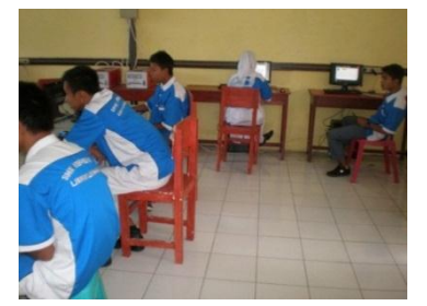
Figure 2. Students' activities

Samples of smallgroupquestions are 'do youwantto use it? do youfindthe e-module interesting? does the e-module makeyouwanttolearn more aboutsteelbuildingmaterials? whatelements are boring?, etc'. Afterwegatheredtheinformationaboutthe performance and ease of administrationinstead of error debugging and intrinsicqualities, thenwereviewedthe data and makedrevisions. Prototype 2 isevaluatedbystudents in determine thepracticality of thedevelopedproduct. smallgroup in orderto Thenbasedonstudents' opinions in smallgroup, prototype 2 revised so producedprototype 3.