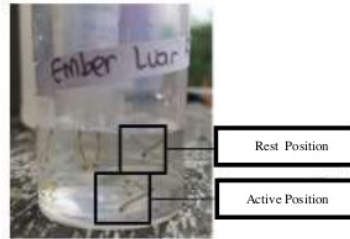
Figure 1. Active Position and Rest Position Mosquito Larvae

The observations under the microscope were performed to distinguish between these genera with weak magnification, as shown in Figure 2.