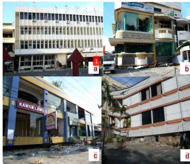
Figure 3.1. The Padang earthquake on September 30 & October 1, 2007: a). The Office of DPU Padang experienced soft story on the 1 st floor but it was still survived, b). The 3 - story-shophouse experienced severe soft story at the 1 st floor. This floor collapsed, and the 2 nd & 3 rd floors fell on it, c). & d). Two commercial buildings experiencing severe soft story both at the 1st floor. The 1 st floors collapsed, and the 2 nd and 3 rd floors fell on them.

The aforementioned procedure of calculating columns and beams dimensions that fulfils the strong column - weak beam and non-soft requirements are expected to reduce the potential soft story because the soft story is one of the most dangerous types of building irregularity (Mezzi, 2006). Boen researches in Padang, Bengkulu and Yogyakarta (Boen, 2006, 2007a, 2007b) show that the most frequent and deadly structural failure due to large earthquakes is the soft story (see figure 3.1).