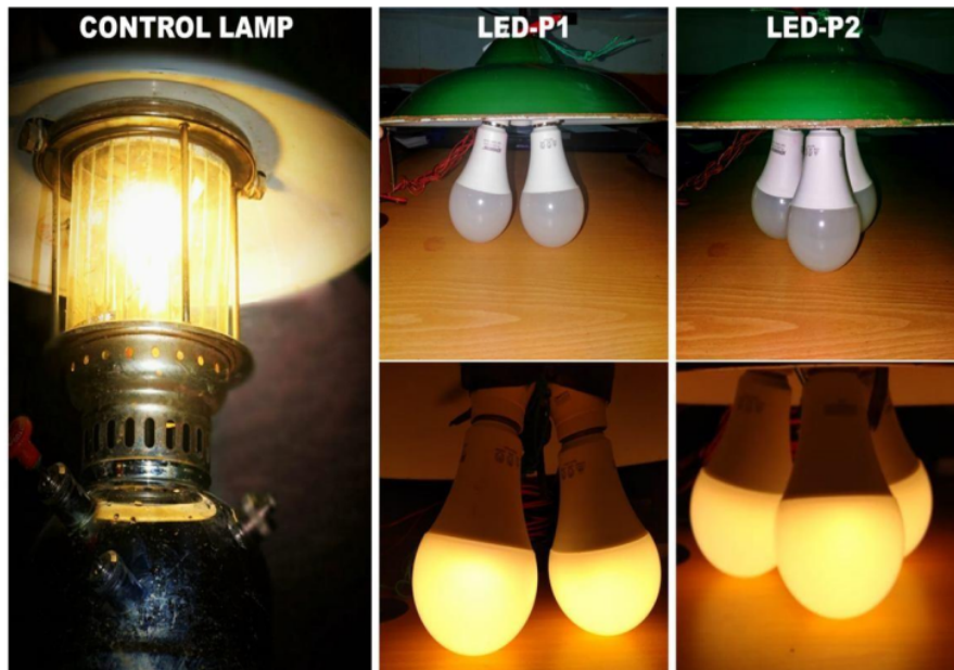
Figure 2. Designing lamp types of stationary lift net used in this experiment. The traditional kerosene lamps were used as a control treatment (left), and two LED types (center and right) as LED treatments.

Data analysis. For estimating the effect of lamp types on target and non-target catch, we have used non-parametric analysis based on the Kruskal-Wallis test (Ostertagová et al 2014; Vieira et al 2017). This test was applied to check the statistical differences between the experimented lamp types on the target and non-target catch. Additionally, the Mann-Whitney U-test was adopted for comparing statistical differences between two groups of experiments and selected the optimal experiments (Thurstan et al 2017; Vieira et al 2017). A significance level of 0.05 and two-tailed distributions were applied for both tests. Both tests were performed by using SPSS 21 software.