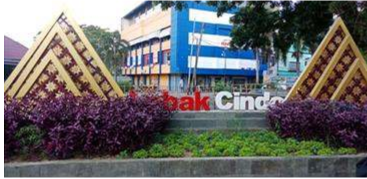
Figure 10. Tanjak ornaments in LebakCindo Radial 10