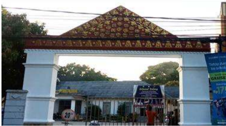
Figure 8. Tanjak ornaments at SMK Negeri 3 Palembang 8