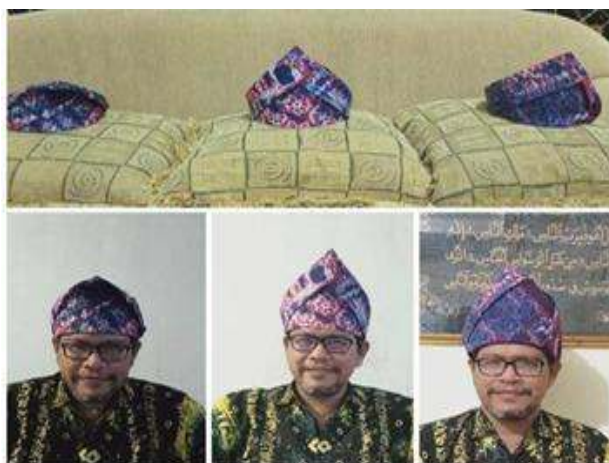
Figure 2. Types of tanjak in Palembang 2

The types of Palembang tanjak consist of tanjakkepundang , tanjakmeler , tanjakbelanumbang , and ikat-ikat ketangbekarem . There are many types of tanjak , the only difference being the type of material used. Along with the development along many eras, there have been many types of tanjak circulating in the people of Sumatra Selatan. According to Mr. Ali Hanafiah, this is not a problem as long as the philosophy of tanjak remains in strongly held.