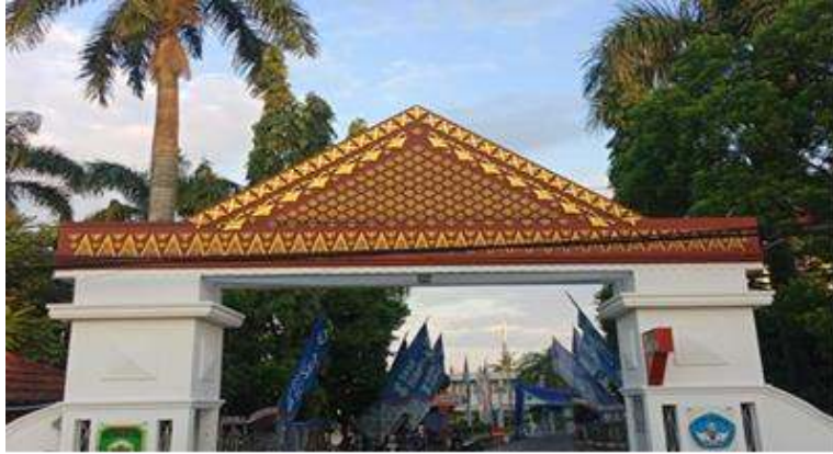
Figure 7. Tanjak ornaments at SMA Negeri 1 Palembang 7