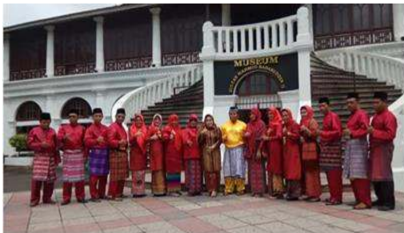
Figure 11. PNSof Palembang's Department of Culture and tourism wearing traditional Palembang clothes