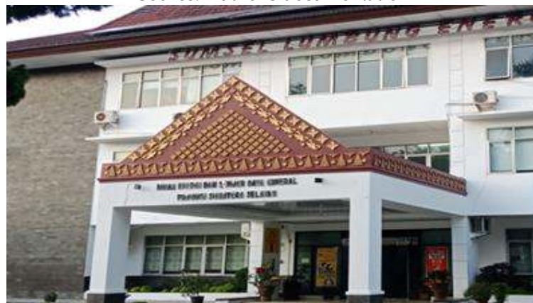
Figure 6. Tanjak ornaments at the Department of Energy and Mineral Resources of Sumatra Selatan 6