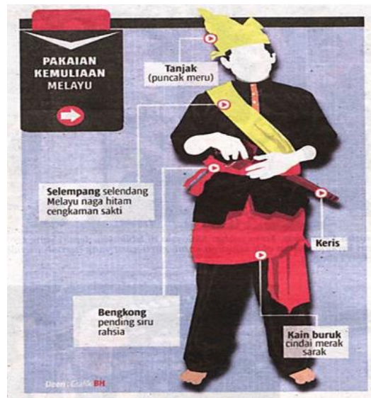
Figure 1. The use of Malay traditional clothes and tanjak 1

Malay traditional clothing is a manifestation of the Malay culture itself, where the shape, structure, function, ornamentation, and manufacturing method have certainly existed from past time and passed down from one generation to the next, serving as a form of preserving the culture. One of the main components of Malay culture is Malay traditional clothing. This traditional Malay dress was formed and explicitly designed by the Malay community by prioritizing creativity and aesthetics as well as the meaning contained therein (Handoko, 2017). Likewise, it is true with tanjak itself, which was created as a manifestation of the high value of dress in the Malay tradition.