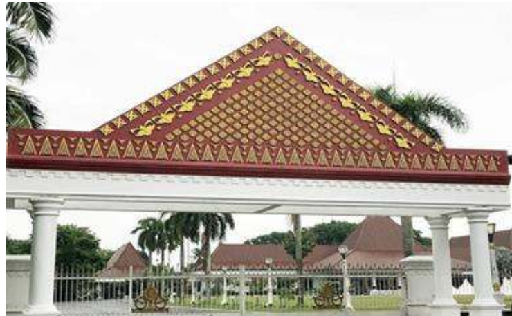
Figure 5. Tanjak ornaments at Griya Agung 5

After the Sumatra Selatan provincial government ratified this governor regulation, several offices and tourist attractions started to build their tanjak ornaments. So far, from the observations of this study, several offices and tourist attractions that have used tanjak as office ornaments are as follows: