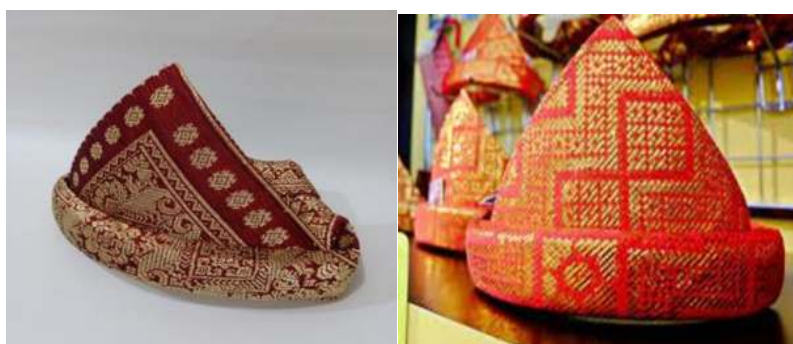
Figure 4. Songket Tanjak 4