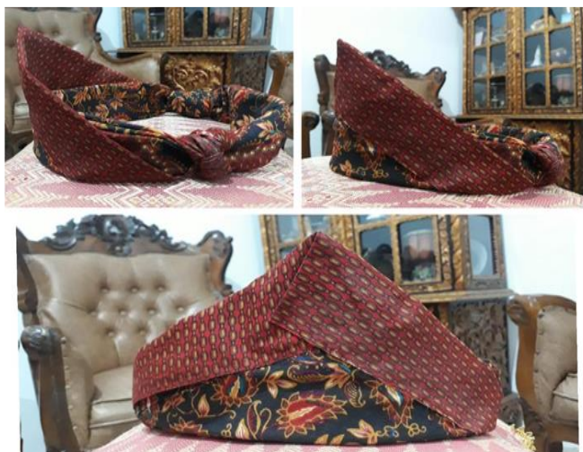
Figure 3. The typical tanjak of Palembang 3