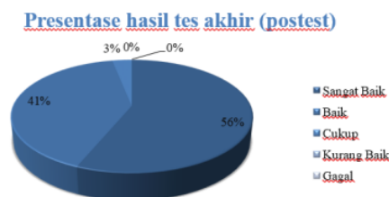
Pie Diagram 2. Details of Student Completion Percentage through posttest

After that, the learning media produced in the ancient remains of the Sriwijaya kingdom using Adobe Premiere Pro CC 2019 was presented through the Share Screen menu on the zoom meeting platform. After the learning is completed, the subject is given a posttest of 10 other questions via the Google Forms link. The posttest results obtained for 32 students were 86.87. The results of the posttest can be seen in the chart: