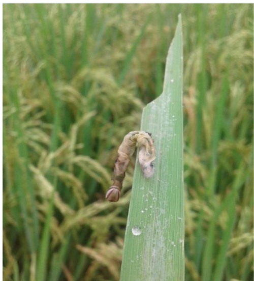
Figure 2. An insect pest, Pelopidas mathias infected by Beauveria bassiana on paddy field

Note: * = significantly different; values within a row followed by the same letters were not significantly different at P < 0.05 according to Tukey's HSD test