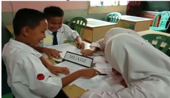
Picture 1. Student's collaboration

immediately explained to him. After understood, the students read the question and then he tried to answer the question by himself without asking his friends. The collaboration among students began during when the activities of jumping tasks and the teacher occasionally controlled them to ensure they could work on the questions and still gave them instructions to help each other if there were friends who asked to be taught.