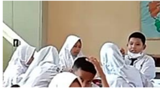
Picture 2. Student's collaboration

Then in core activity, the model teacher divided students into seven groups with heterogeneous abilities, gave them an explanation about the lesson. After that, teacher gave students worksheets: the first was the sharing task and the second was jumping task. In the beginning, all students did the question individually. The researcher focused on observing one student. The result showed the student with initial N was very enthusiastic and followed the lesson well even when looking at the pictures on the slide about kind of traditional food from Palembang. After that, he often leaned his body into a chair, held his head and sometimes unfocused because he was busy with his activities. The teacher always controlled each group. When in N's group, the teacher gave suggestions them to asked friends "please teach me" but the N did not pay attention to the teacher, but he covered his face with his hands. After the teacher left, then the N asked his friend. Then, in jumping task, N had many discussions with his friends. In this focus group, the collaboration among students run well. Students in groups did not ignore the members of the group who had difficulty in answering the questions. It is supported the statement from Vygotsky (1978), the collaboration of students and experts on real-world problems or tasks that were built on the language, skills, and experiences of each person formed by each individual's culture in the social context.