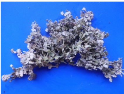
Figure 3 Halimeda micronesica

The result of measurement of waters quality in Maspari Island obtained average temperature value of 29.33°C, DO (Dissolved oxygen) content of 4.25 mg/L, salinity 32.67‰, and pH value of 7 and density of 1 024.67 kg/m 3 . The value of the measurement of the parameters of the waters is presented in Table 1.