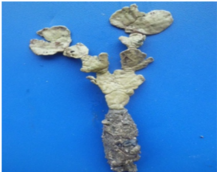
Figure 2 Halimeda macroloba

Halimeda micronesica has a lush, small, curved and green thallus. Thallus will turn whitish when H. micronesica dies. The seaweed has a single, hard holdfast. The branching of thallus has a trichotomous type. The thallus segment of H. micronesica has a width of 66.15 mm and a segment length of 93.60 mm. The thallus segment forms a semicircle like a kidney shape. The results of H. micronesica measurements are presented in Figure 3.