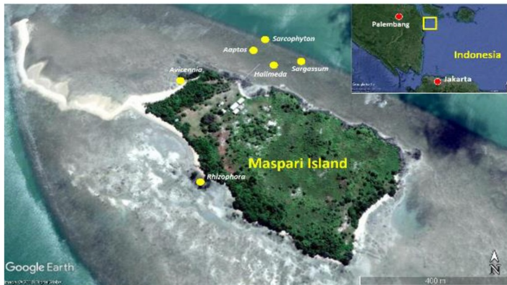
Figure 1. Sampling location of marine biota.

Bacteria isolates used for the test were six isolates of Vibrio sp. (with code V. spp1 to spp6 ), isolates were isolated from Vannamei sp. shrimp ponds at shrimp farming location in Sungsang, South Sumatera. In addition, the performance is also tested on the bacteria S. aureus and E. coli using Nutrient Broth (NB) and Nutrient Agar (NA) growing media. Inhibition test is done with agar diffusion (10.000 ppm for extract concentration). The extracts were tested using paper disks and solvents as controls with repeated three times (Rozirwan et al. , 2015).