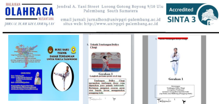
Figure 1. Pocket Book Cover and Taekwondo Kick Technique Movement

Initial observations were made with initial test tests that showed a significant difference in average results between the initial and final tests. The average initial test measurement result was 46.67 and the final test was scored at 82.33, resulting in an average difference of 35.66.