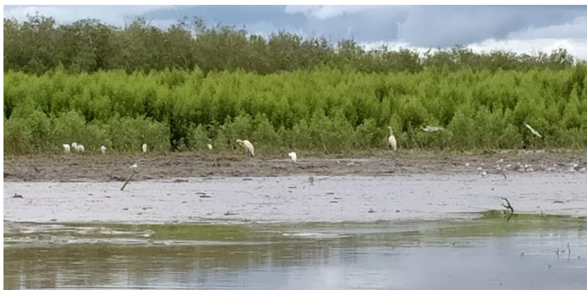
Fig. 2. Crabs habitat of migratory birds ground at Berbak-Sembilang National Park

On the substrate, fine black mud was found with a depth of 60 to 100 cm. The results of the environmental parameter measured salinity was 27 to 29 psu, temperature was 29 to 30°C, pH was 6.08 to 6.2, nitrate and phosphate were 6.69 and 0.197 mg L -1 .