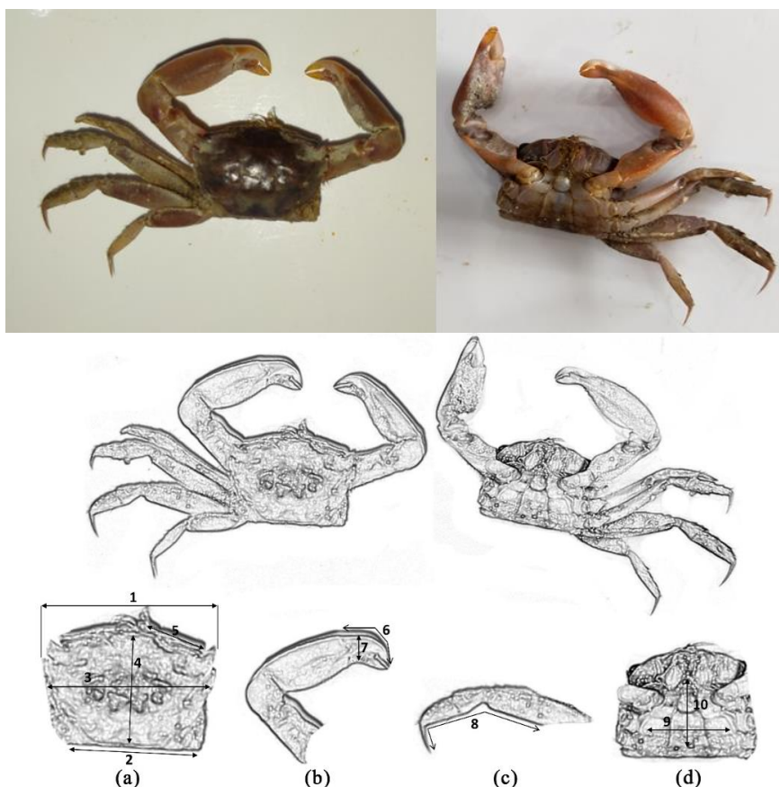
Fig. 4. Details of the morphological characters Metaplex longipes (Stimpson, 1858) (C2) species that considered for morphometric analysis: (a) carapace, (b) cheliped, (c) leg, (d) abdomen