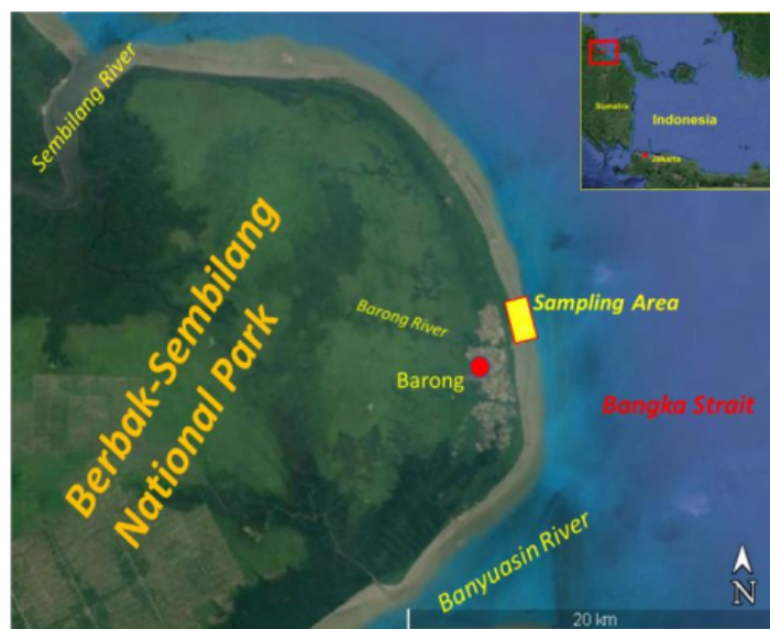
Fig. 1. Sampling site

Habitat crabs is a transit area for migratory birds in the Berbak-Sembilang National Park, Indonesia, which is an estuary area with extensive mangrove vegetation. The migratory birds species in this area are Calidris alpina , Charadrius mongolus , Limosa lapponica , Limosa limosa , Limonodromus semipalmatus , Numenius arquata , Tringanebularia , and Tringa tetanus [11]. Besides that, stork and shorebirds were also found [12]. However, at the sampling time of 25 October 2020, there was no large flock of migratory birds due to it was not the bird's arrival season, namely November and March. This region and its surroundings have a mud substrate, is commonly covered by mangrove Avicennia marina species [13-15], and is directly affected by the freshwater masses from the Barong and Banyuasin rivers [16, 17]. Map of sampling location is presented on (Fig. 1).