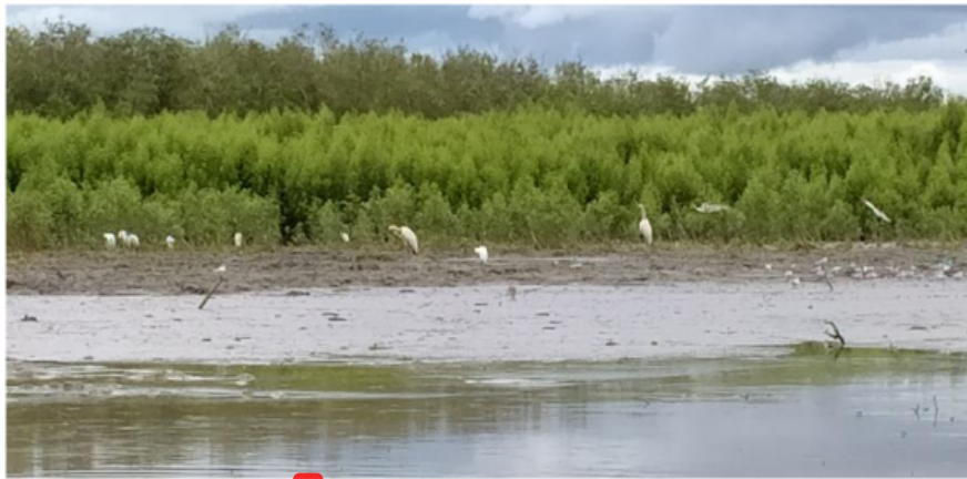
Fig. 2. Crabs habitat of migratory birds ground at Berbak-Sembilang National Park

On the substrate, fine black mud was found with a depth of 60 to 100 cm. The results of the environmental parameter measured salinity was 27 to 29 psu, temperature was 29 to 30°C, pH was 6.08 to 6.2, nitrate and phosphate were 6.69 and 0.197 mg L -1 .