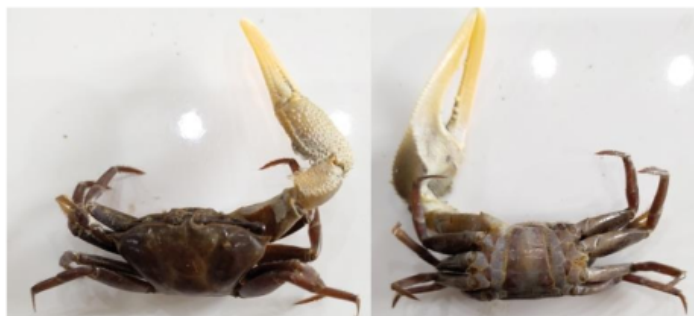
Fig. 3. Details of the morphological characters Uca dussumieri (Edwards, 1852) species (C1) that are considered for morphometric analysis: (a) carapace, (b) cheliped, (c) leg, (d) abdomen

There were 14 individuals coded C1-14 of the station observation. Morphologically, it looked unique in the size of the claws, which was bigger in one (Fig. 3).