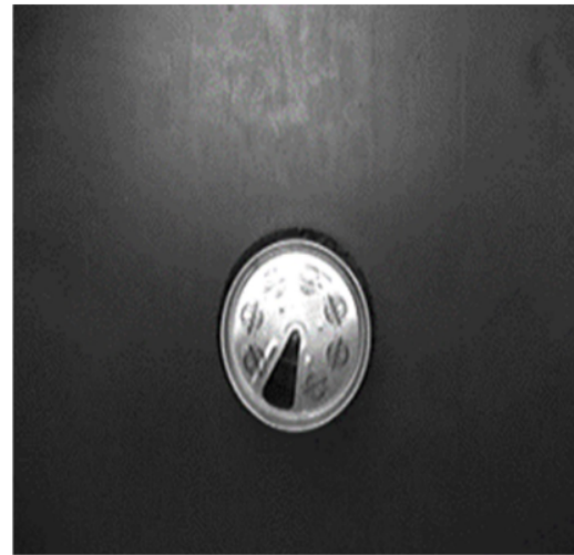
Fig 1. object on the conveyor was detected by a webcam

The image capture contained image acquisition and image pre-processing steps. The feature extraction contained cropping and extraction steps, where the cropping consisted of template matching and window feature. On the other hand, the extraction comprised edge and color extraction, thus similarity measurement is to measure the similarity between the measured features and the values stored in the database.