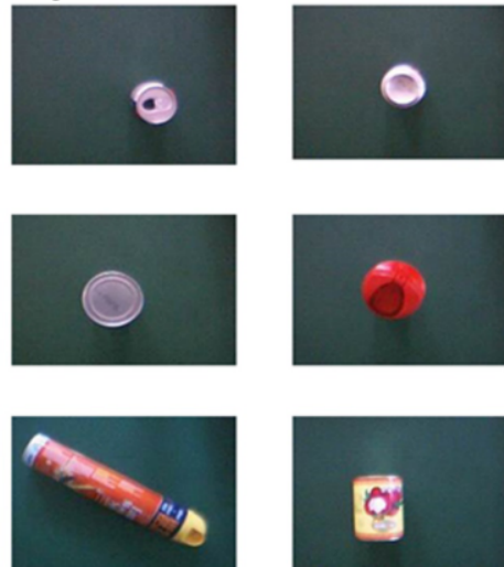
Fig 2 The standard pose of the cans

Some factors, such as lighting conditions, speed of the conveyor belt, camera gain, contrast and brightness, height of the camera above the object, may strongly influence the quality and sharpness of the final image; experiments were carried on in order to find an optimum configuration.