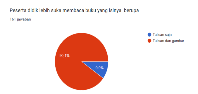
Figure 1. Diagram of Student Questionnaire Results

Based on the questionnaire distributed to students to find out the needs of students at SMP Negeri 33 Palembang, the analysis results were obtained that students of SMP Negeri 33 Palembang liked learning materials equipped with pictures compared to material that was only in the form of text. The following is a diagram showing the data: