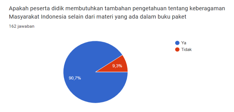
Figure 2. Student Questionnaire Results

understand the material better. Below is the diagram of the questionnaire results on student needs regarding diverse material in Indonesian society: