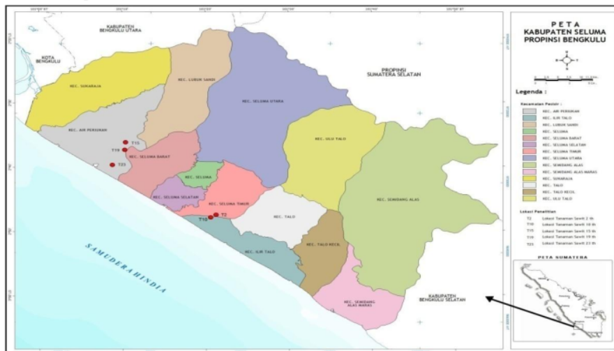
Fig. 1: Location of Sampling (T2, T10, T15, T19 and T23) in Seluma Regency, Bengkulu Province.

Study was conducted on peatlands in oil palm plantations, Seluma Regency of Bengkulu Province (Southern Sumatra, Indonesia). Peatlands used as a study site consists of five age strata of oil palm stands, that is the age of 2 years (T2), 10 years (T10), 15 years (T15), 19 years (T19) and 23 years (T23). In this study, the stand ages of oil palms also represent the reclamation ages of peatland. The location of palm stands with ages of 2 and 10 years in the District of East Seluma and Ilir Talo, which lies in the geographical position of 4°8'56.1"-4°9'13.1" LS and 102°34'24.2"-102°34'53.1" BT, while three other locations in the District of Air Periukan in the geographic position of 4°0'51"-4°3'21.2" LS and 102°25'42.3"-102°26'48.3" BT. Based on the records of GPS, the coordinate points of the study sites consisting of T2, T10, T15, T19 and T23 can be seen on a map of the study locations (Figure 1)