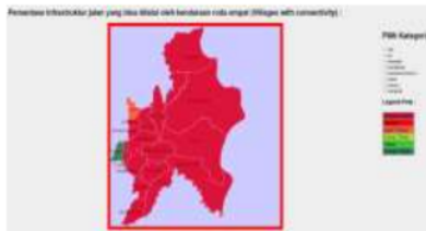
Fig.. 1 Map of the Percentage (%) of the area that cannot be passed by four-wheel vehicles (%)

Of the 18 sub-districts in Ogan Ilir, there are 16 sub-districts whose status is very vulnerable because they cannot be passed by four-wheeled vehicles. This is caused by the topography of the township which is an area of peat bog. Thus, it affects the road construction which becomes unstable and the road tend to be damaged easily since it is traversed by thousands of trucks from different regions. According to 5, the condition of the infrastructure will have an impact on food price in the region due to poor road conditions. This will also increase the transportation costs that will result in higher food prices.