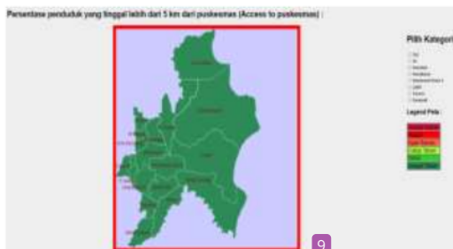
Fig. 6 Map of the percentage of the citizens lived 5 km away from public health centers

6. Indicators Percentage of the citizens lived 5 km away from public health centers