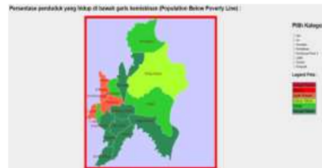
Fig. 7 Map of the percentage of the citizens is in below poverty's line

7. Indicator Percentage of the citizens is in below poverty's line