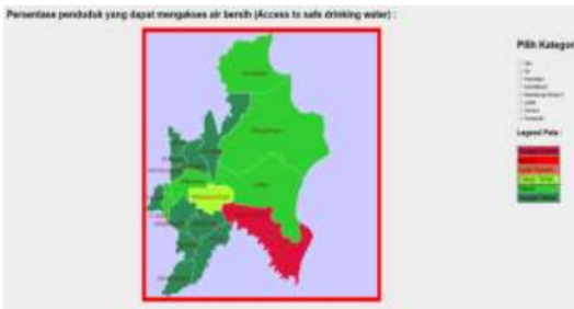
Fig. 5 Map of the percentage of the citizens didn't get clean water.

5. Indicator Percentage of the citizens didn't get clean water.