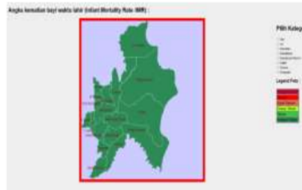
Fig.. 3 Map of infant mortality rate

Entire districts have very resistant to the status indicator infant mortality rate because the district has an infrastructure OKI health services are evenly distributed throughout the village, good health centers, health centers, as well as poskesdes. hanya there are few villages that do not have health care. According to the impact of food insecurity is a region in child mortality [5].