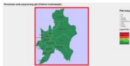
Fig. 4 Map of the percentage of toddler's malnutrition

Entire districts have status indicator is highly resistant to the percentage of toddler's malnutrition this is caused by the OIC region is an area of food production and perairan region that produce a lot of fish, so access is easier and affordable food for the people. According to 5 nutritional status can be used as an indicator of the use of food in a region.