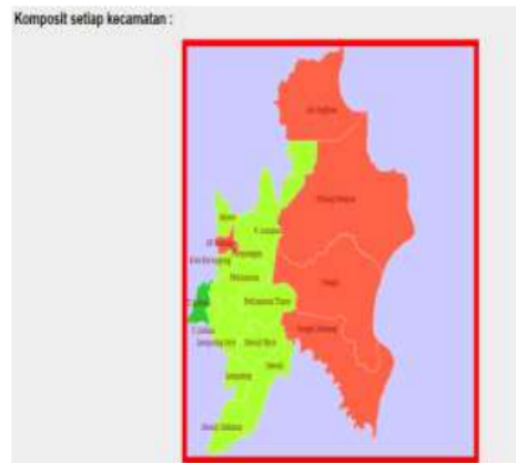
Fig. 8 Map based on a composite analysis of food security