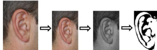
Fig 2. Ear Image Pre-process