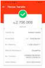
bukti setor sti 540.jfif 58K