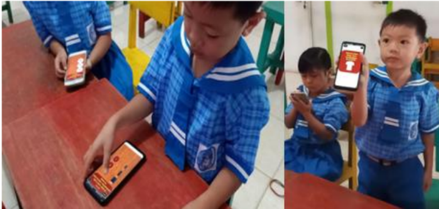
Figure 6. The children's expression when solving the game

The Figure 6 depicts how the children solved the game of arranging vinegar bottles. It shown that the children had a serious expression during the game. Not only were they motivated to learn, but the children were also curious about the next activity and game. Other than in games, children also take pleasure in challenges. The challenges that they overcome in a game and the rewards earned are the source of joy for children when solving a problem or discovering an answer. A pleased expression is a sign of children's curiosity about mathematics learning (Litman, 2005).