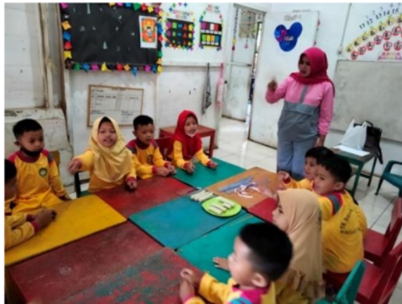
Figure 2. The teacher giving the children an explanation prior to the game

This activity is one in which children were introduced to measuring the length of pempek through a game. The children were given a problem through the game and were commanded to listen to the instruction given by Arjuna (the game's icon). The children were guided by the teacher in using their handphones as learning media, in which case the children received information from the teacher regarding how to use the handphones as well as explanation regarding early mathematics. In this activity, the children exhibited considerable enthusiasm and posed questions on how to press the buttons on the game. They enthusiastically completed the game, where they arranged pempek in the order from the longest to the shortest following the direction from the teacher. This activity is not only a matter of playing a game; it also allowed the children to think and to use their reasoning in choosing pempek from the longest to the shortest (see Figure 2 ).