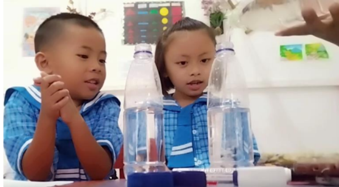
Figure 7. The children observing the water filling process

Child 2 : I think this one has more volume.