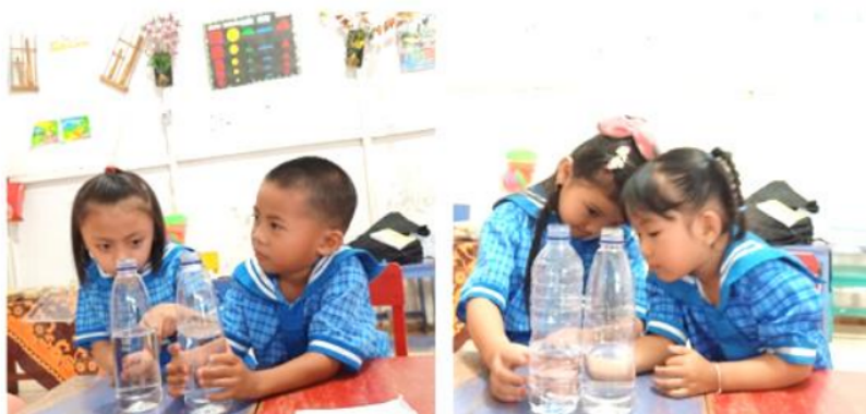
Figure 8. The children measuring the bottle with the most content

The next activity was comparing two bottles of the same size and shape, one of which was filled with water and the other was also filled with water in the same volume. The children were instructed to tell the teacher to stop filling the bottles when the water volumes of the two bottles were equal. The children followed this instruction enthusiastically and looked very curious about whether the volumes were truly equal. They inspected the volumes directly. Then, one bottle was replaced by another that was of a different size and the water inside the first bottle was poured to the second bottle. The children were asked to measure which bottle had more content. The children then compared the contents of several vinegar bottles and decided which bottle had more content than the other. This activity is depicted in Figure 8.