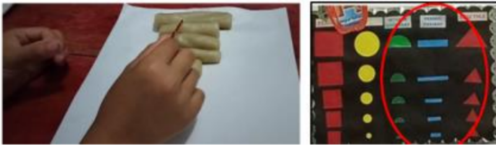
Figure 4. The children's strategy in comparing lengths

it was extremely easy for them to solve this problem. Below is how the children solved the problem in arranging pempek from the longest to the shortest (Figure 4).