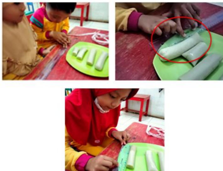
Figure 5. An introduction to the ruler as a measuring tool

The children were given a ruler in the introduction to measurement. The authors and the teacher then guided the children in using the ruler as a simple medium of measuring and gave them a problem through the game where the children were instructed to compare longer and shorter pempek . The children looked at the ruler and observed the numerals on the ruler. They asked about the function of the ruler and how to measure the pempek . In this activity, the children were introduced to the ruler as a means of measuring an object. The children showed enthusiasm about using a tool like a ruler and were engrossed in the activity. The children's strategy is depicted in Figure 5.