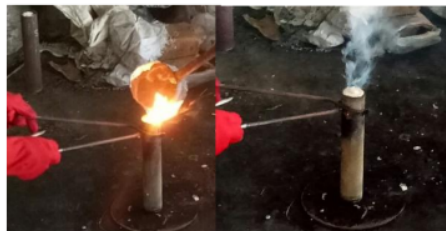
Figure 2: Pouring into the Cylinder

In the pouring of aluminum into a cylindrical tube that already contains charcoal powder, the measured pouring temperature is around 650°C. In this case, the molten aluminum has heated the charcoal powder directly, in this case the moisture content has evaporated completely. The decrease in temperature due to this temperature difference has lowered the temperature of the molten aluminum, but rapidly, the gas in the volatile matter burns, and by itself raises the temperature of the molten aluminum again. It is estimated that the formation of fixed carbon at this temperature, in accordance with what is said by Speight [1]. However, in the tube, the formation of ash is estimated to almost not occur, because the temperature inside the cylinder tube does not reach 900°C