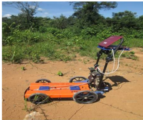
Figure 2. Georadar OKKO with frequency of 250 MHz