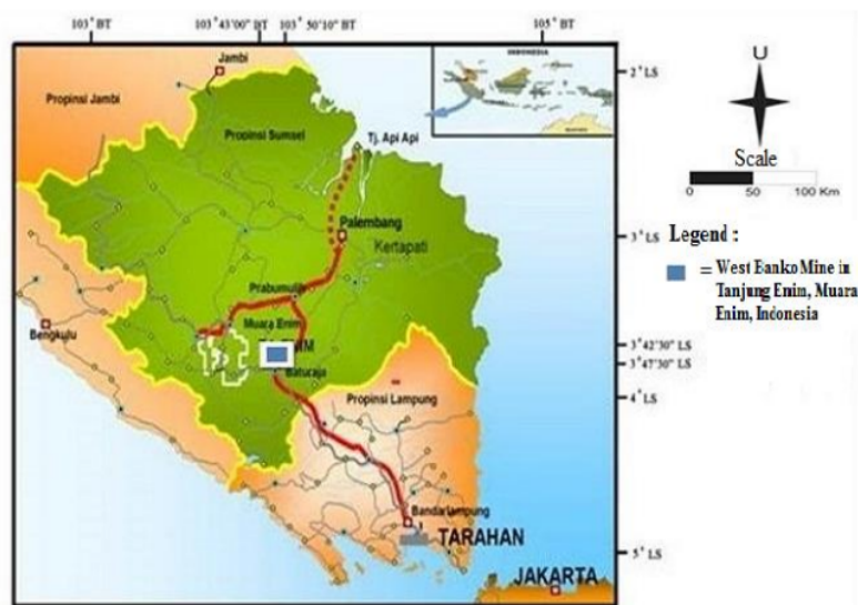
Figure 1. Location Map of the Research

This research was conducted in the western Banko mining area in Tanjung Enim. The West Banko mine area was chosen as the location of the study because this area still leaves a fundamental problem with acid mine water management. While on the other hand, according to the Research Center for Mineral and Coal Technology, West Banko is very potential to be developed because the slope is still stable and with a stripping ratio of "waste / coal ratio" ranging from 1.32 to 2.57. Location map of Banko barat is shown in figure 1.