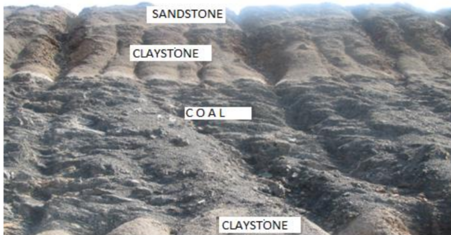
Figure 3. Overburden and interburden outcrops