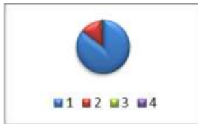
Picture 1. The Diagram Shows Percentage of Scientific Literacy Themes That Appear in Book A

The results of the analysis of the second category of scientific literacy books used in schools in the district north Indralaya can be described in the diagram below :