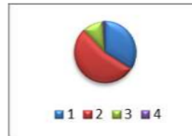
Picture 2. The Diagram Shows Percentage of Scientific Literacy Themes That Appear in Book B