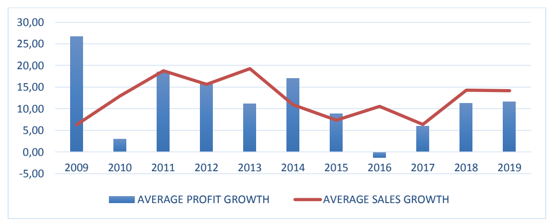
Figure 1. Average Profit and Sales Growth of Manufacturing Companies on the IDX

https://jurnal.stie-aas.ac.id/index.php/IJEBAR