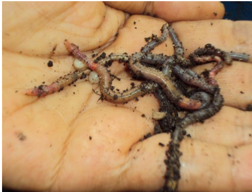
Figure 1. Pontoscolex corethrurus earthworms found in the study site

P. corethrurus are classified as endogeic earthworms ( top soil species ) having a wide distribution in tropic condition 10, 18) . This worm type also has a high adaptability to fluctuation environmental conditions and wide tolerance to soil pH 18) . Soil pH measured in the five study sites ranged from 4.0 up to 4.3 (Table 2). This proves that the worm Pontoscolex corethrurus