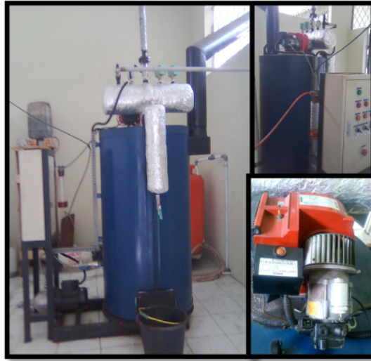
FIG. 1. The fire tube boiler.

6 An emission factor relating emissions to the heat input rate for the boiler is expressed as