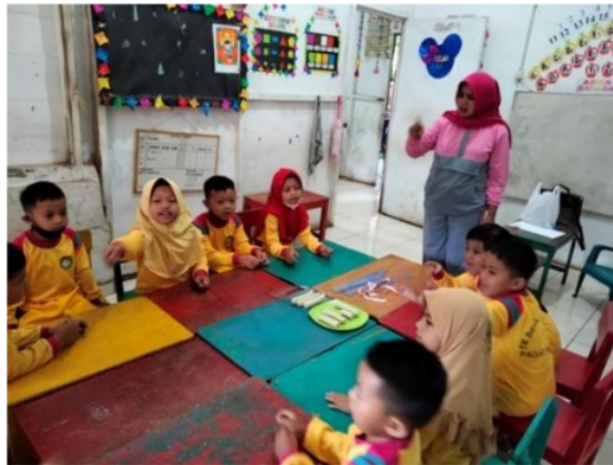
Figure 2. The teacher giving the children an explanation prior to the game

This activity is one in which children were introduced to measuring the length of pempek through a game. The children were given a problem through the game and were commanded to listen to the instruction given by Arjuna (the game's icon). The children were guided by the teacher in using their handphones as learning media, in which case the children received information from the teacher regarding how to use the handphones as well as explanation regarding early mathematics. In this activity, the children exhibited considerable enthusiasm and posed questions on how to press the buttons on the game. They enthusiastically completed the game, where they arranged pempek in the order from the longest to the shortest following the direction from the teacher. This activity is not only a matter of playing a game; it also allowed the children to think and to use their reasoning in choosing pempek from the longest to the shortest (see Figure 2).