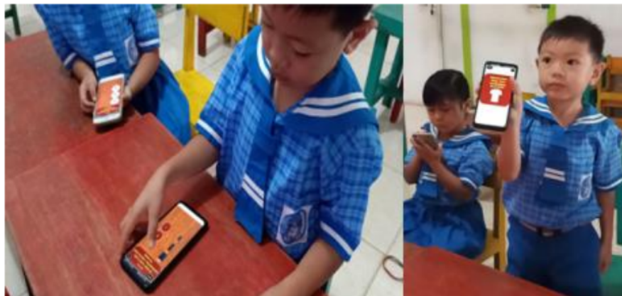
Figure 6. The children's expression when solving the game

The Figure 6 depicts how the children solved the game of arranging vinegar bottles. It shown that the children had a serious expression during the game. Not only were they motivated to learn, but the children were also curious about the next activity and game. Other than in games, children also take pleasure in challenges. The challenges that they overcome in a game and the rewards earned are the source of joy for children when solving a problem or discovering an answer. A pleased expression is a sign of children's curiosity about mathematics learning (Litman, 2005).