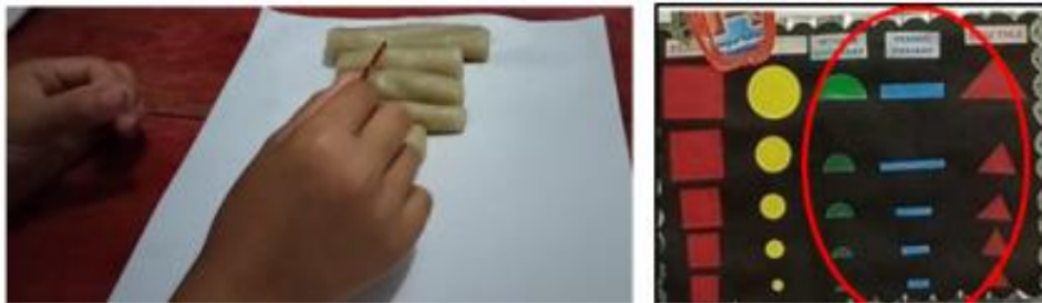
Figure 4. The children's strategy in comparing lengths

it was extremely easy for them to solve this problem. Below is how the children solved the problem in arranging pempek from the longest to the shortest (Figure 4).