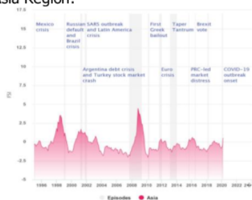
Figure 1. Asia Financial Stress Index

Following the crisis and the contagion evident around the region, The Asian Development Bank (ADB) uses their knowledge to help monitor the financial recovery and report objectively on potential vulnerabilities and policy solutions. Financial Stress Index (FSI) is being used 29 by ADB to monitor the recovery by measuring the degree of financial stress in four financial 19 markets within the Asia Region. Figure 1 shows the Financial Stress Index (FSI) for The Asia Region.